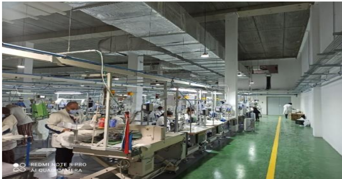
15 August 2021 Installation of the first assembly lines