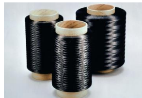
Carbon Fiber Composite Materials