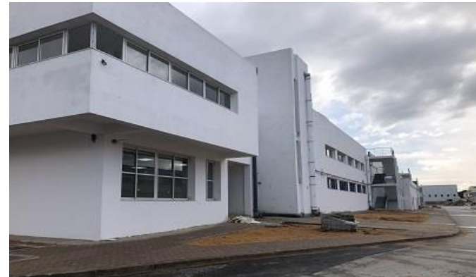
Date of the end of the project : December 2021