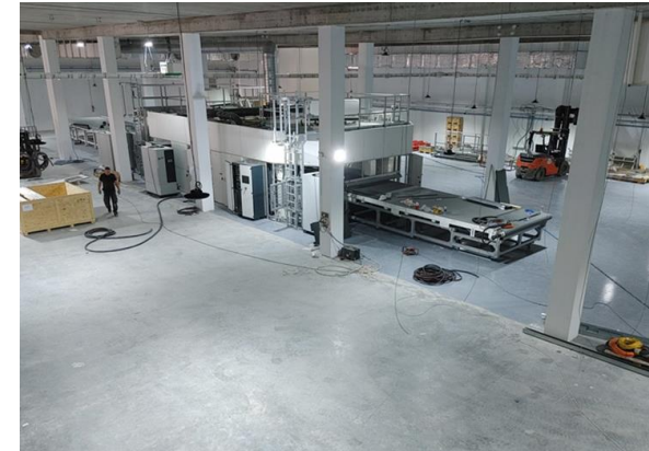
10 August 2021 Installation of the first cutting machine