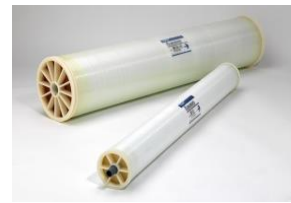
Environment and Engineering