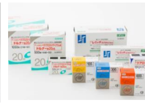
Life Science and Others