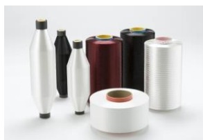
Fibers and Textiles