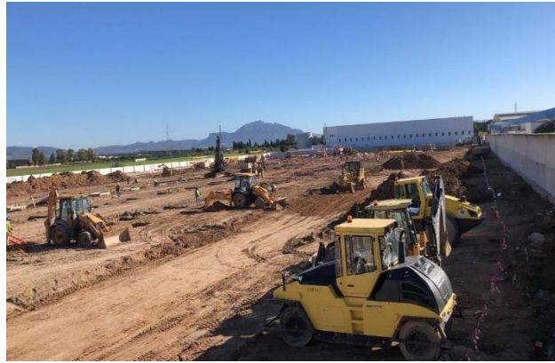
16 December 2020 Start of construction work