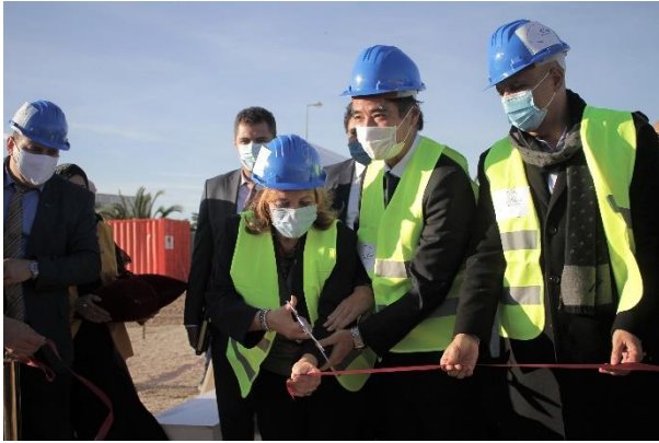
04 December 2020 The groundbreaking ceremony